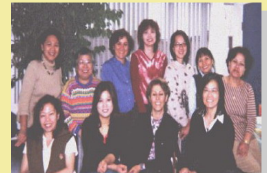
PIRS Outreach Workers and Teacher's Assistants